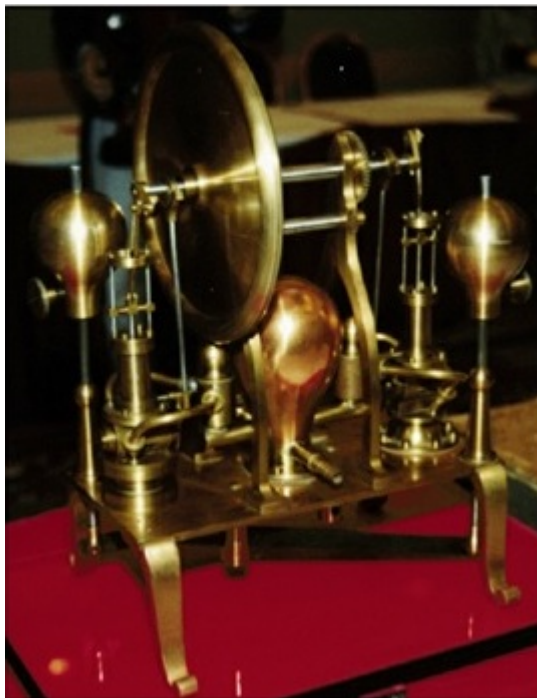
Keely's Hydro-Pneumatic-Pulsating-Vacuo Engine operated with etheric vapor.