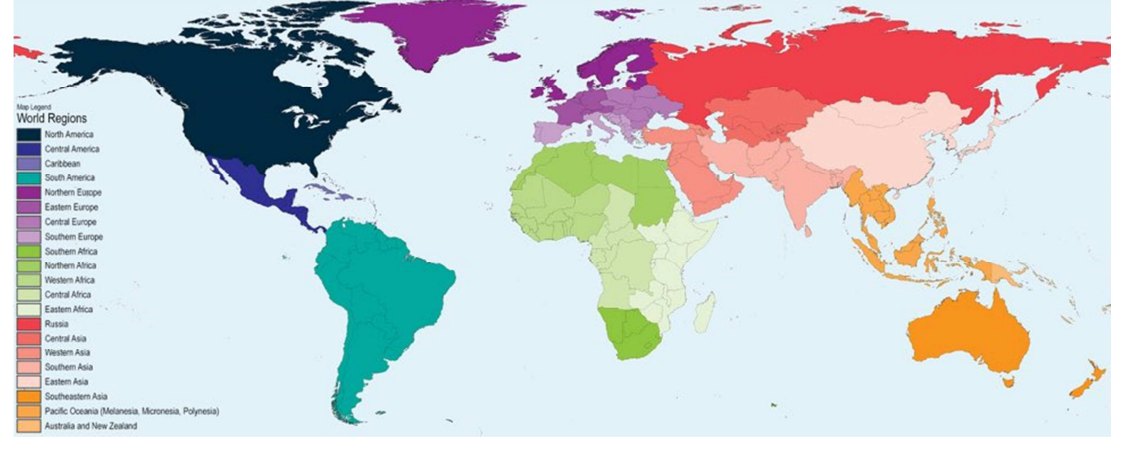
Figure 3. World Reference Map (Peters projection).