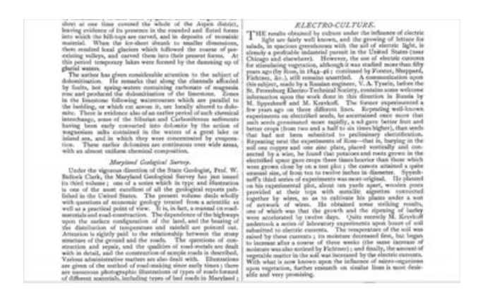
Figure 1: Coverage on electroculture in Nature, 1900.

In April 16, 1900, there was a Nature magazine edition, mentioned about electroculture: