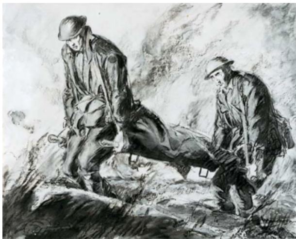
Figure 3. Australian stretcher bearers on the Somme (Will Dyson, 1917, Australian War Memorial Canberra, public

"For men thrown into the fighting at Pozières the experience was simply hell ... Stretcher-bearers worked to exhaustion, usually exposed to fire, carrying men to the aid posts close behind the front line. Sergeant Albert Coates recorded: 'Many men buried and torn to pieces by high explosive. For a mile behind the trenches it is a perfect hell of shell fire. Terrible sights. The stretcher-bearers are having a terrible time, some blown to pieces together with their living freight'" (Burness, 2006).