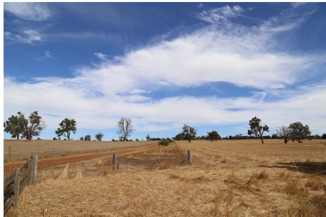
Figure 2. Broomehill, wheat belt of WA.

brothers' farms were all within a few miles of each other, roughly in a straight line between the towns of Flat Rocks and Borderdale ... Italian names prevailed when the brothers selected their properties which bore titles like Sorrento, Etna and Belvedere" (Triaca, 1985, p. 89).