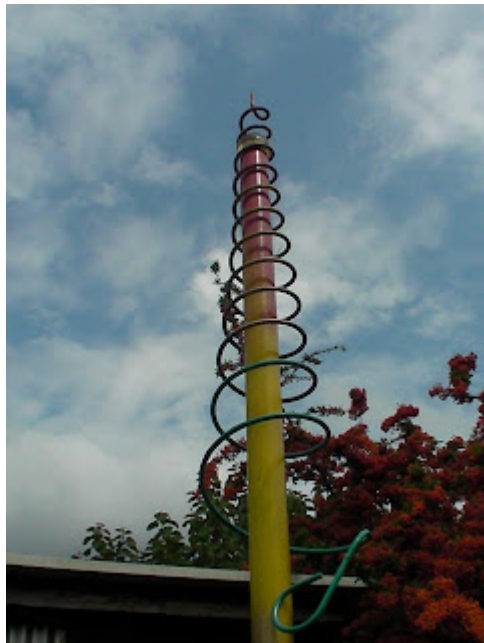
Using color sequencing for vibrational effect.