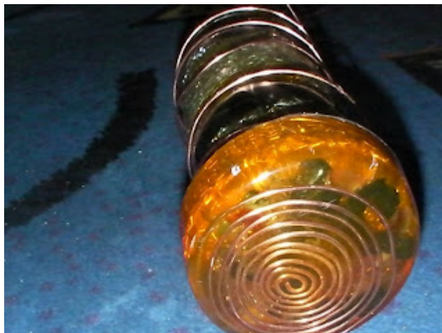
Nice view of the Tesla Coil